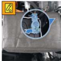
Deactivating the high-voltage system

Disconnect the 12V low voltage negative pole (in the engine compartment)