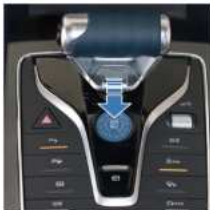
Turning off (Power meter "OFF" )

Press the power button without pressing the brake pedal