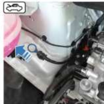
Disconnecting from the charging station (emergency release)

Pull the loop (in the engine compartment)